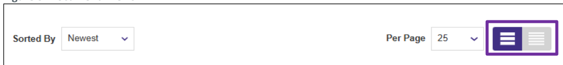
Figure 3: Document Views

The Snapshot view is a more detailed view of each document entry with written descriptions of each action button.