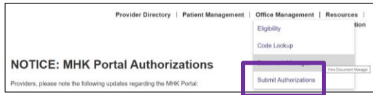
Figure 1: Office Management Menu

Document Manager is available from the Office Management dropdown menu.